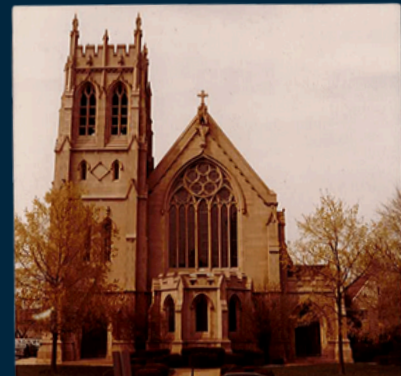
Grace Church in Chicago where Jimmy Carter visited a Habitat Conference

Habitat for Humanity has given us the opportunity to share for those in need.